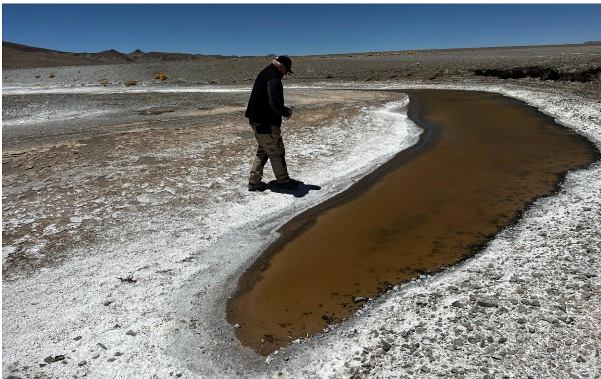
Figure 2: Executive chairman/brine geologist Phil Thomas sampling surface brines at Cilon

Total depth, if all wells reach target depth, is 5,300 metres. This drill program may be modified when the first three wells are drilled after reconciling aquifer depths and brine flows. At an average drill depth rate of 30m per day, the Company expects each 400m well to take 14 days with five additional days allocated to packer tests for assaying the lithium brines.