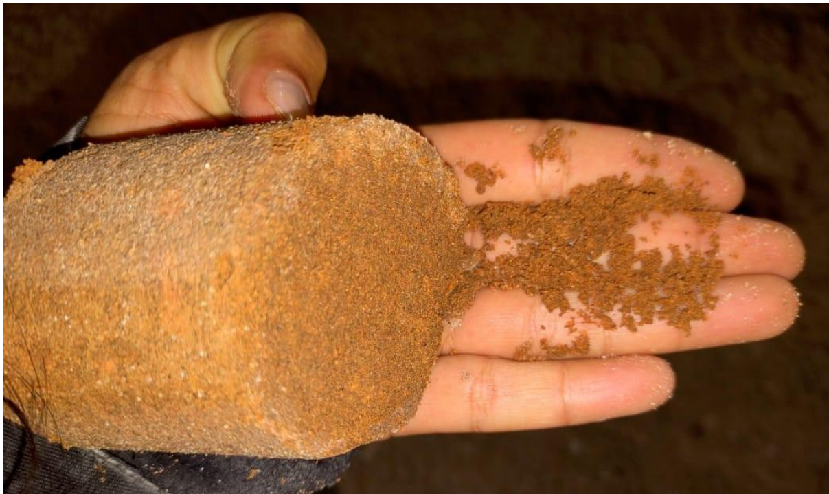
Figure3: Porous sands at 152m depth in top section of aquifer