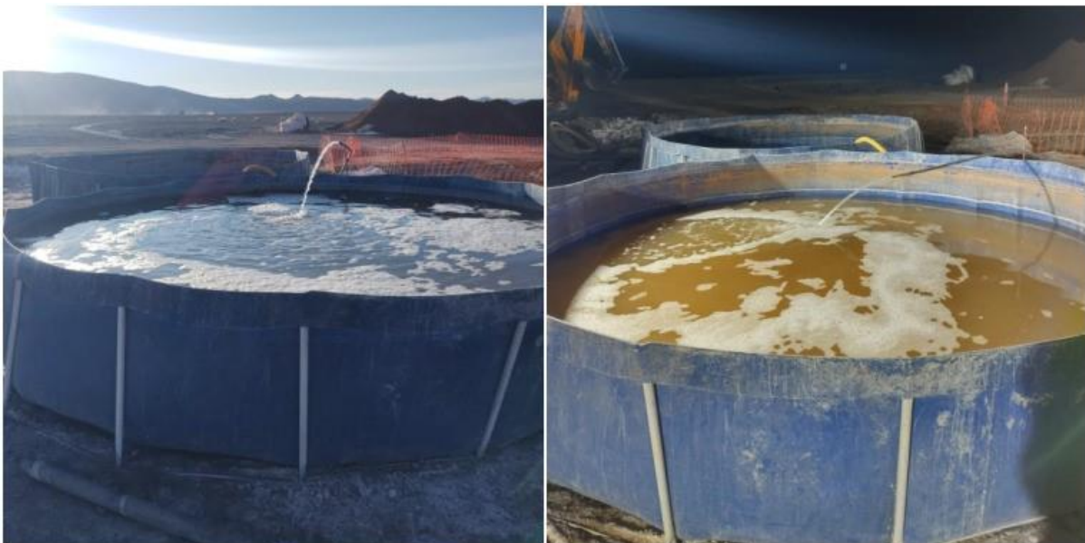
Figure 1. The 11,000 litre tanks were filled up 17 times during the brine release pump test.

Patagonia Lithium Ltd (ASX:PL3, Patagonia or Company) is very pleased to announce the receipt of the results of the 187,000L brine release test that showed the aquifer can withstand high pump rates from the exceptional porosity and deep aquifer.