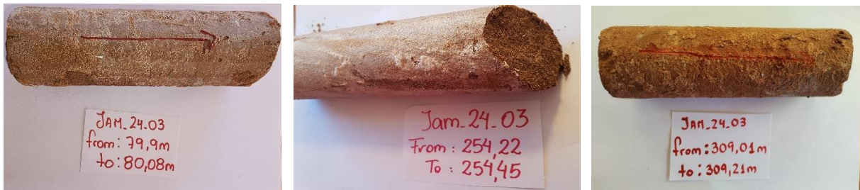
Figure 1. Three of the five cores sent to Core Laboratories for testing

Patagonia Lithium Ltd (ASX:PL3, Patagonia or Company) is very pleased to announce that five cores have been selected for core analysis to give the geologists effective and total porosity values to input when they compute the Mineral Resource Estimate.