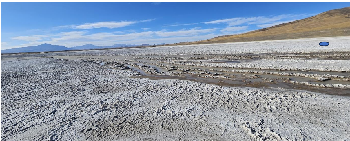
Figure 2. Location of well 4 blue dot (top right) showing salt on surface

Phillip Thomas, Executive Chairman commented "These cores contain sand and quartz gravel and reflect the high porosity geology in the Paso basin. One of the critical factors in lithium production is to have high porosity and ideally sands with high pore values and high connectivity. Examination of the sections in the field demonstrates these qualities. Clay content is very low and in some cores not present."